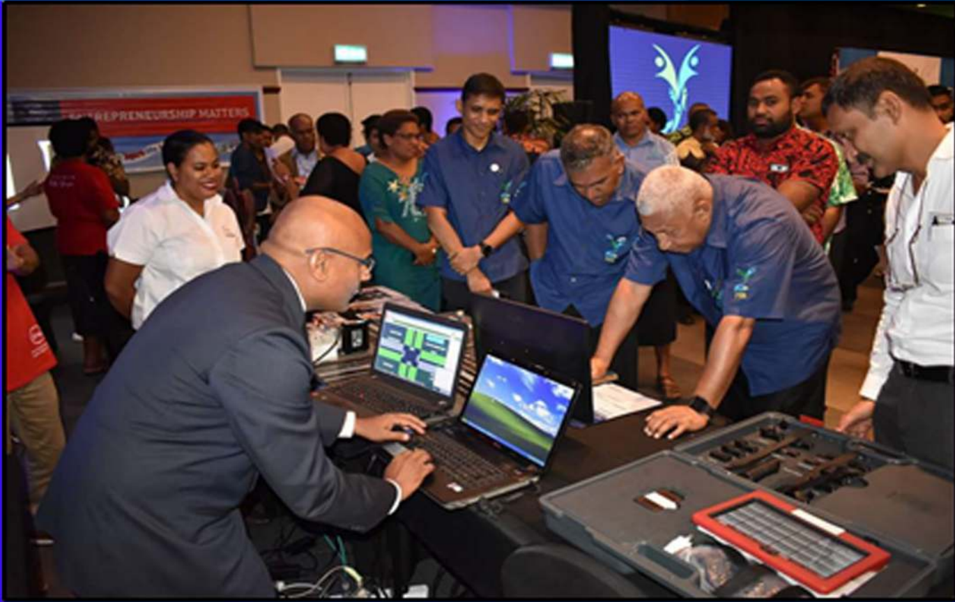
Honourable Prime Minister of Fiji, Rear Admiral (Retired) Voreqe Bainimarama displaying keen interest in the speaker recognition system, a FNU Project, during the launch of the YES (Young Entrepreneurship Scheme) at GPH.