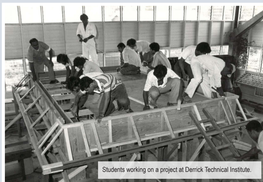
Students working on a project at Derrick Technical Institute.

The 10th-anniversary celebrations will officially be launched on Saturday, 15 February 2020 at the Grand Pacific Hotel in Suva during a ceremony with invited guests.