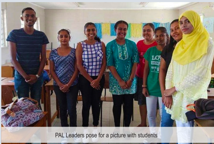
PAL Leaders pose for a picture with students

For more information on PAL, please visit https://www.fnu.ac.fj/new/learner-enhancement/pal