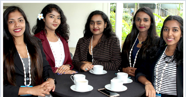
Student presenters from Bachelor of Laboratory Sciences programme.