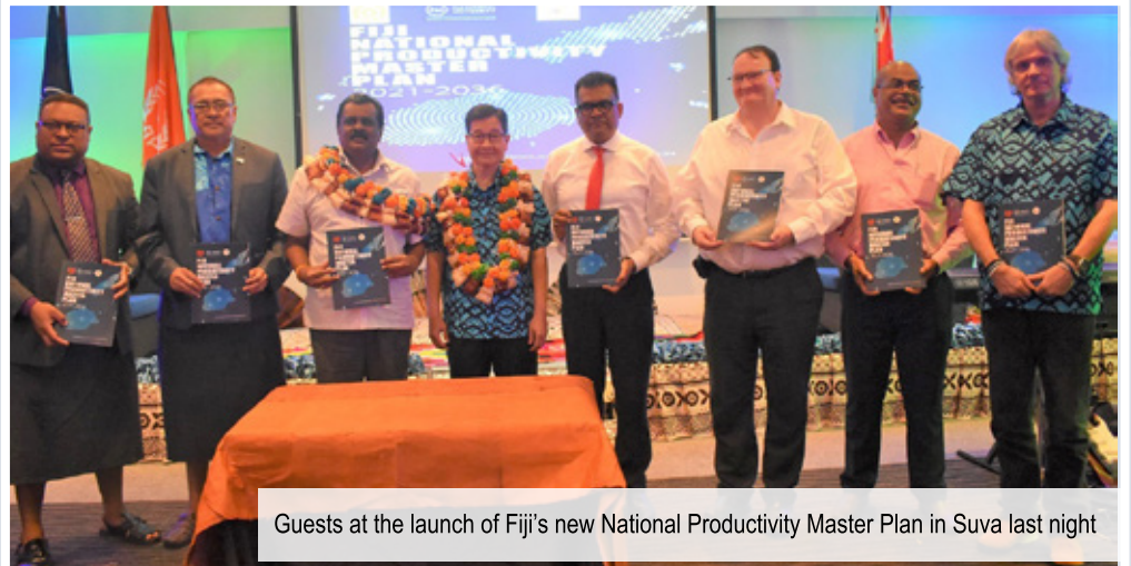
Guests at the launch of Fiji's new National Productivity Master Plan in Suva last night

The launch of Fiji's first-ever National Productivity Master Plan 2021-2036 will set new pathways for Fiji's productivity as well as assist in the reduction of the unemployment rate in the country, according to the Minister for Employment, Productivity and Industrial Relations Honourable Parveen Kumar.