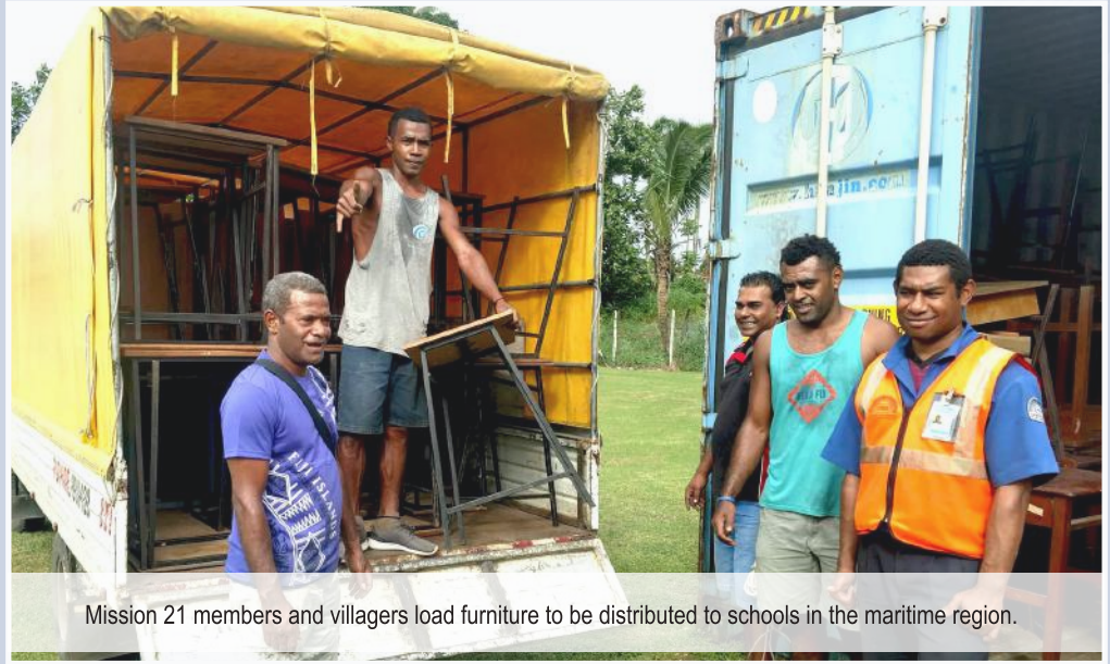
Mission 21 members and villagers load furniture to be distributed to schools in the maritime region.

The Fiji National University (FNU) recently donated furniture that contributed to the rehabilitation of 10 schools in the maritime region.