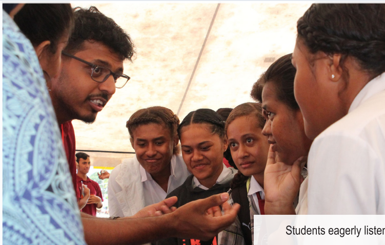
Students eagerly listen in to the presentations.

The two-day FNU Open Day 2019 is expected to attract more than 10,000 students from across Fiji. The FNU is hosting its Open Day at Valelevu Grounds, Nasinu, Labasa Civic Centre and FNU Natabua Campus in Lautoka.