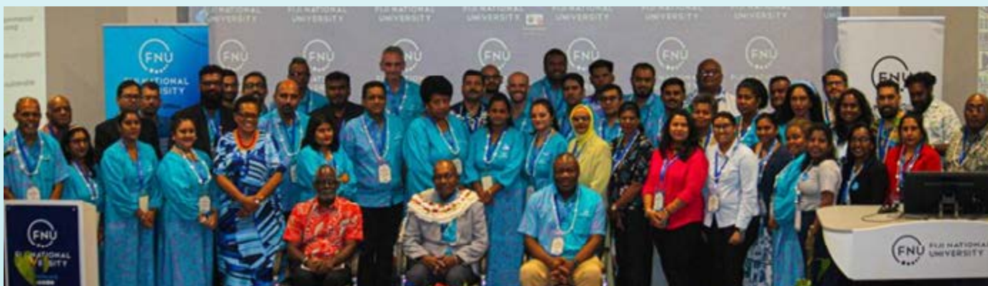
Participants at the 1st FNU Research Symposium

FNU successfully hosted its inaugural Research Symposium at the Nasinu Campus, focusing on national challenges affecting key sectors of the Fijian economy. Held under the theme “Inter-Disciplinary Approaches to National Challenges,” the symposium featured research addressing agriculture, health and medical care, climate change, education, and construction.