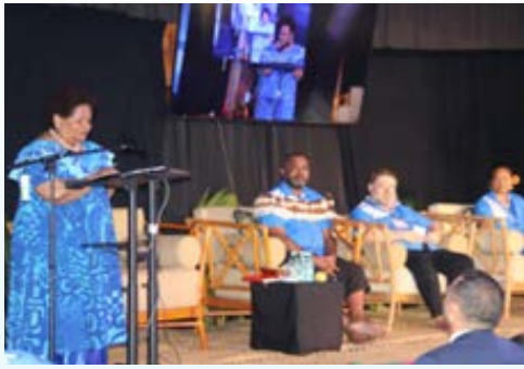
Regional Symposium on Loss and Damage Outcomes (Savusavu, Fiji | 16–18 September 2025)

The Pacific Symposium on Climate Loss and Damage, jointly hosted by FNU, Monash University, and the Pacific Community (SPC), in partnership with the Government of Denmark, convened more than 120 delegates from across the Pacific and beyond. Participants included academics, policymakers, development partners, and community leaders.