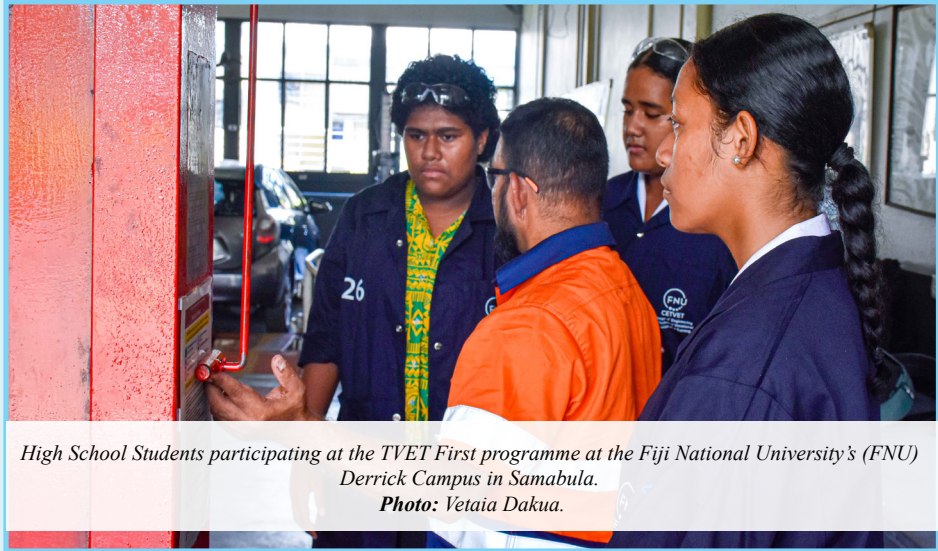
High School Students participating at the TVET First programme at the Fiji National University's (FNU) Derrick Campus in Samabula.