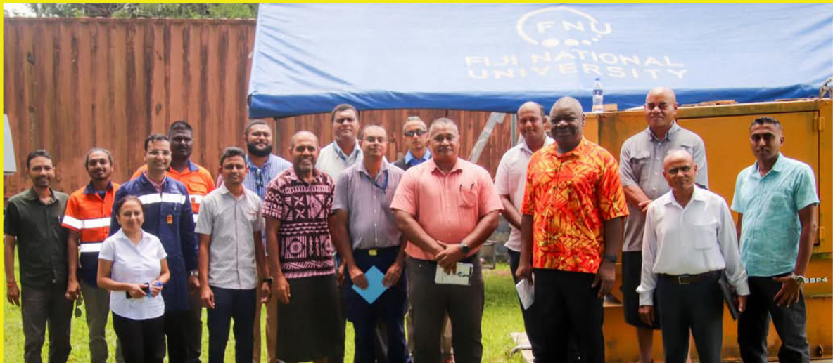
Successful industry research collaboration between the School of Electrical and Electronics Engineering at the College of Engineering and Technical Vocational Education and Training (CETVET) researchers and Telecom Fiji Limited (TFL).