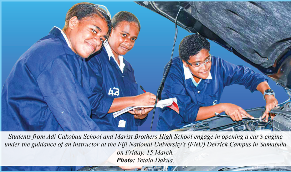
Students from Adi Cakobau School and Marist Brothers High School engage in opening a car's engine under the guidance of an instructor at the Fiji National University's (FNU) Derrick Campus in Samabula on Friday, 15 March.