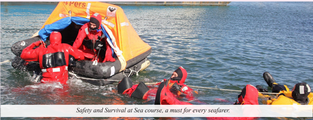
Safety and Survival at Sea course, a must for every seafarer.