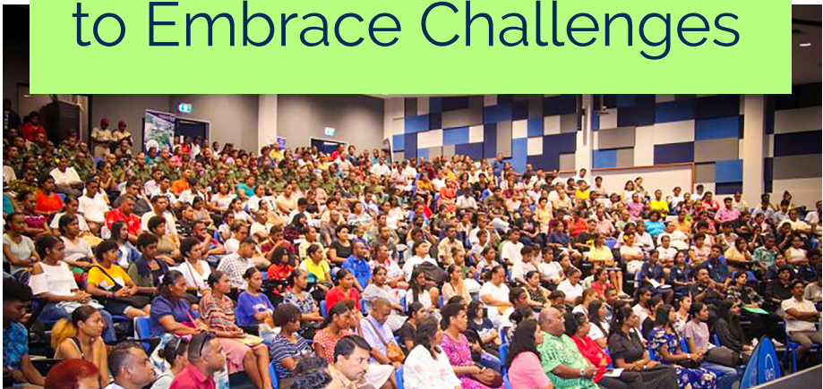
New and existing students during the 2025 Fiji National University Orientation Week held by the College of Business, Hospitality and Tourism Studies on Monday, 10 February 2025.