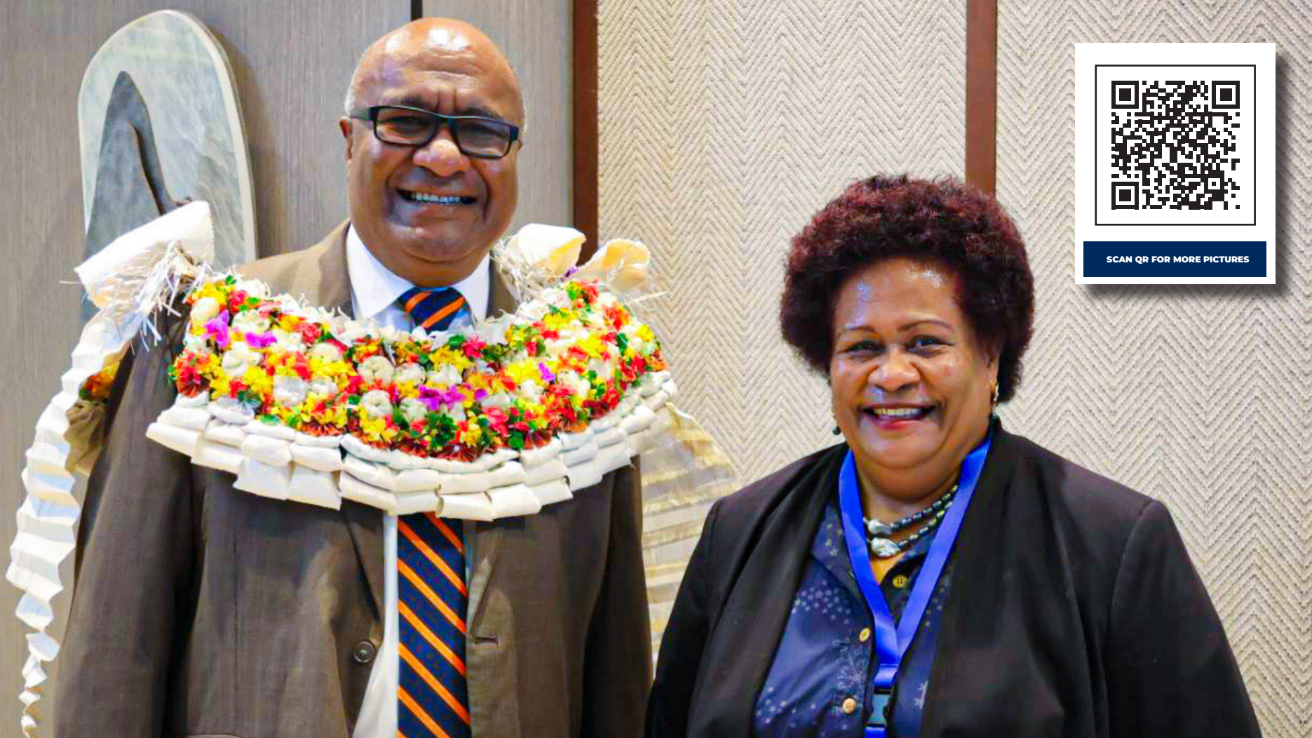
Deputy Prime Minister Honourable Manoa Seru Kamikamica with Fiji National University Vice Chancellor Unaisi Nabobo-Baba.