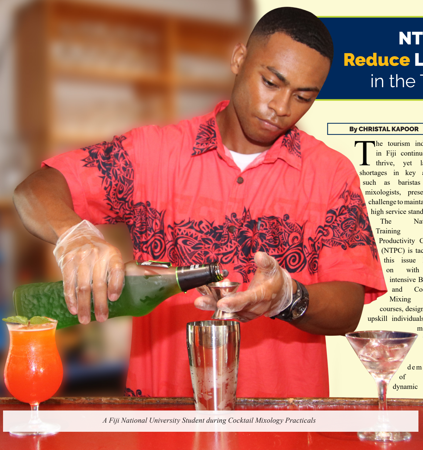
A Fiji National University Student during Cocktail Mixology Practicals