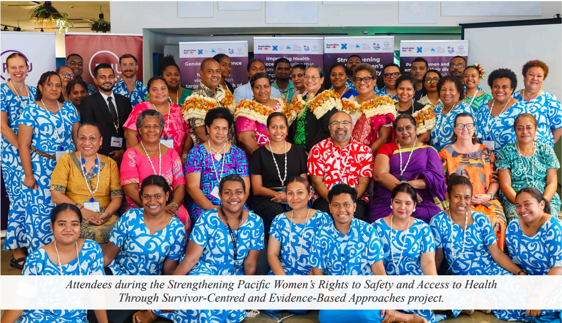
Attendees during the Strengthening Pacific Women's Rights to Safety and Access to Health Through Survivor-Centred and Evidence-Based Approaches project.