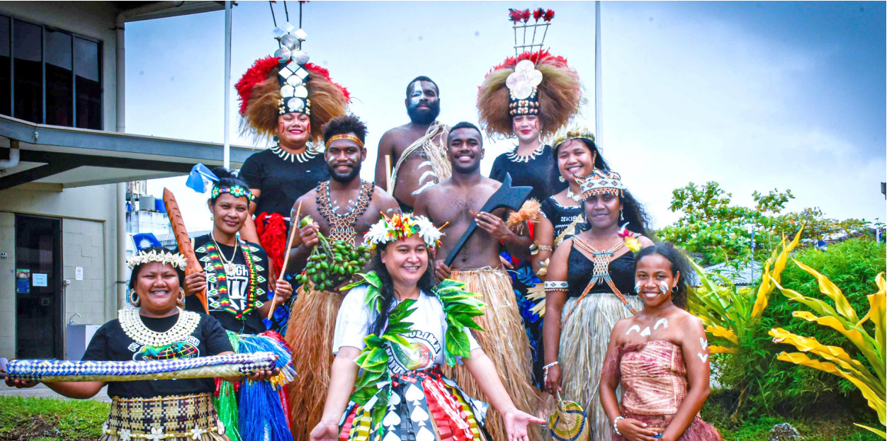
Students from Fiji, Tonga, the Marshall Islands, Samoa, Kiribati, Vanuatu, Tuvalu, American Samoa, the Cook Islands, the Federated States of Micronesia, and the Solomon Islands shared their heritage through traditional expressions.