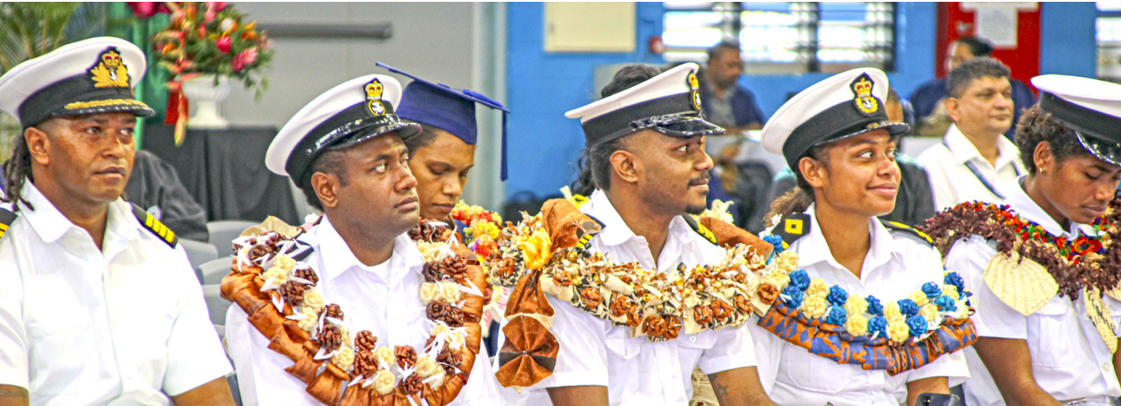
Diploma of Nautical Science graduates from the Pacific Centre of Marine Studies (PCMS) at the graduation ceremony.