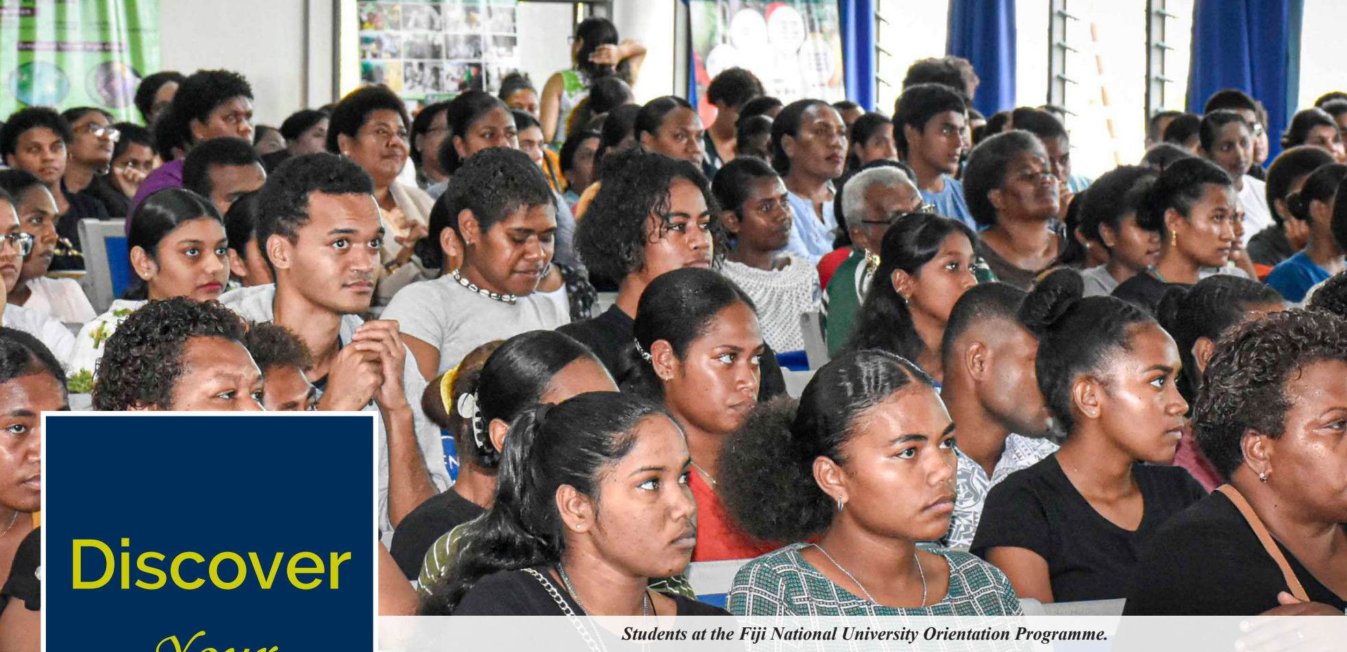
Students at the Fiji National University Orientation Programme.