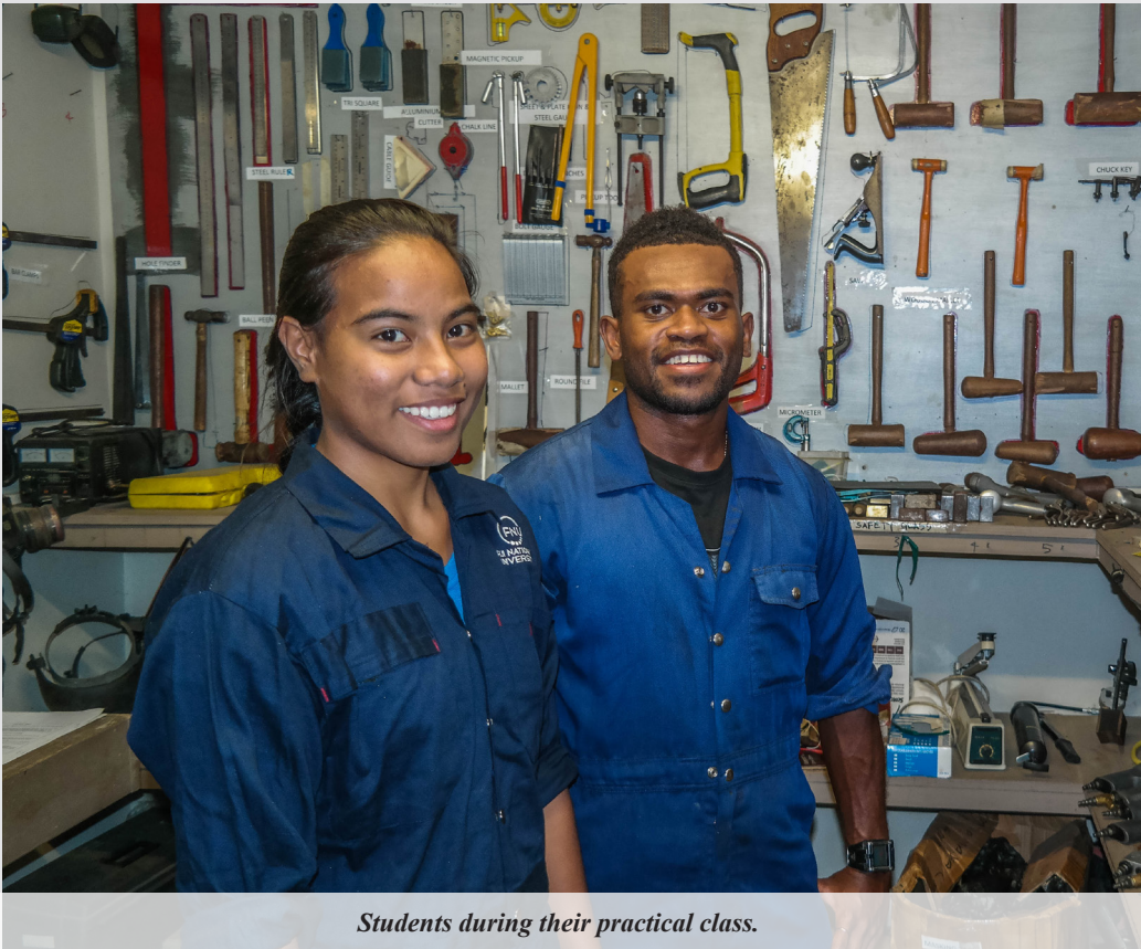
Students during their practical class.

"We have been working in collaboration with industry stakeholders to understand their specific needs and working with our team in FNU to come up with relevant, competency-based programmes that will uplift the standard of the workforce."