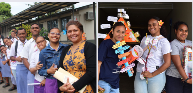
Nasinu Campus Open Day.