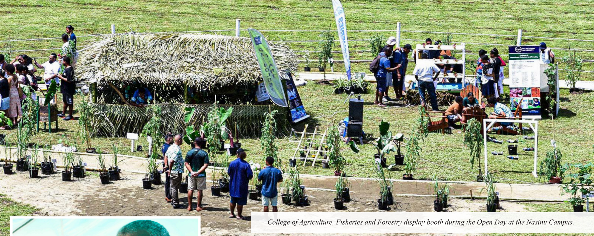
College of Agriculture, Fisheries and Forestry display booth during the Open Day at the Nasinu Campus.