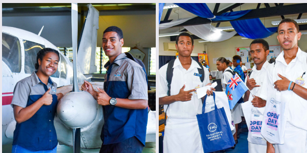
Namaka Campus Open Day.