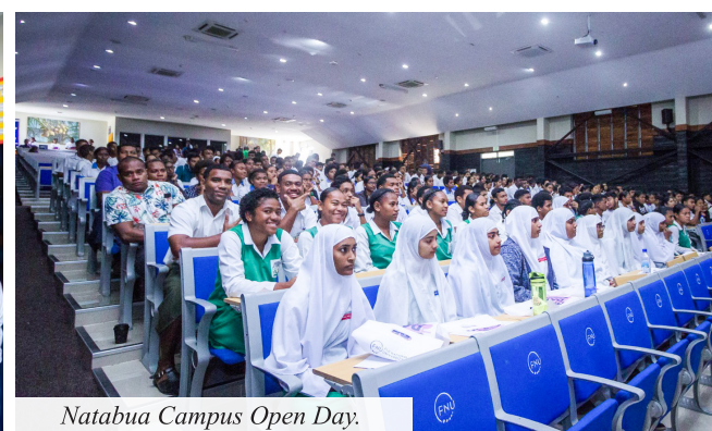
Natabua Campus Open Day.