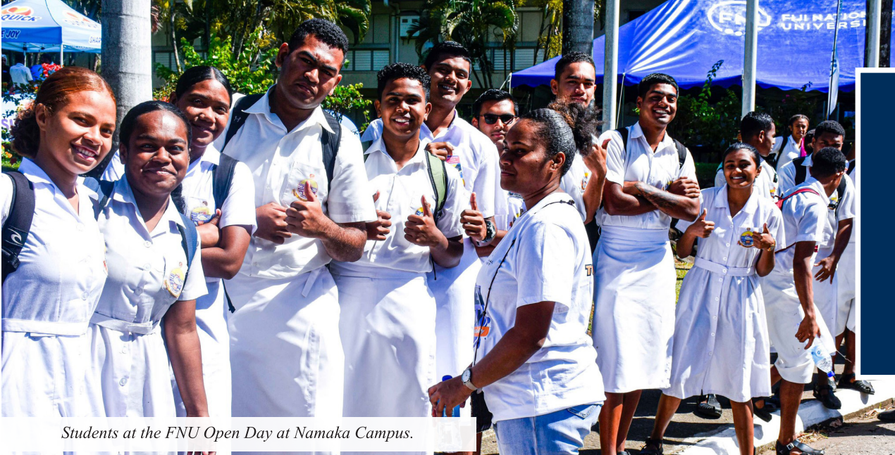
Students at the FNU Open Day at Namaka Campus.