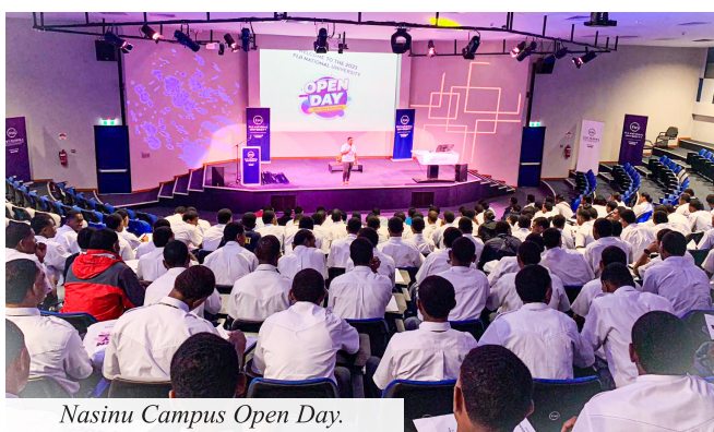
Nasinu Campus Open Day.

across the country at our Naduna, Namaka, Natabua, and Nasinu campuses, from October 5-7.