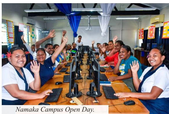
Namaka Campus Open Day.