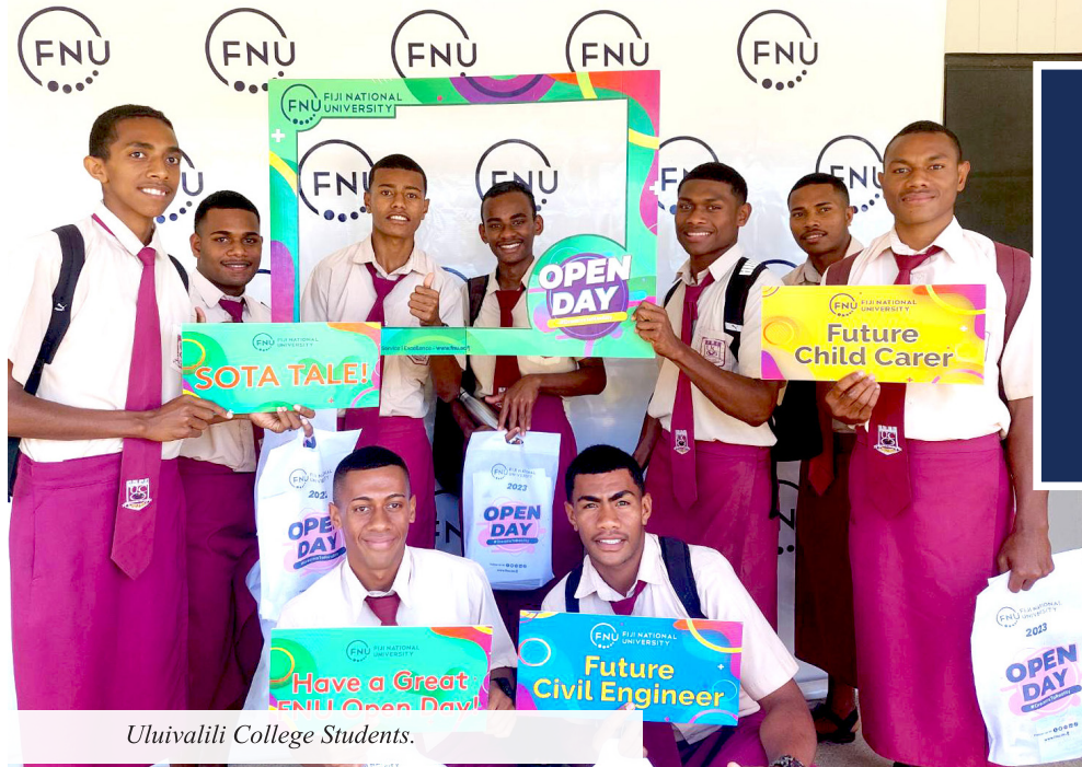
Uluivalili College Students.