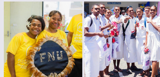
Natabua Campus Open Day.