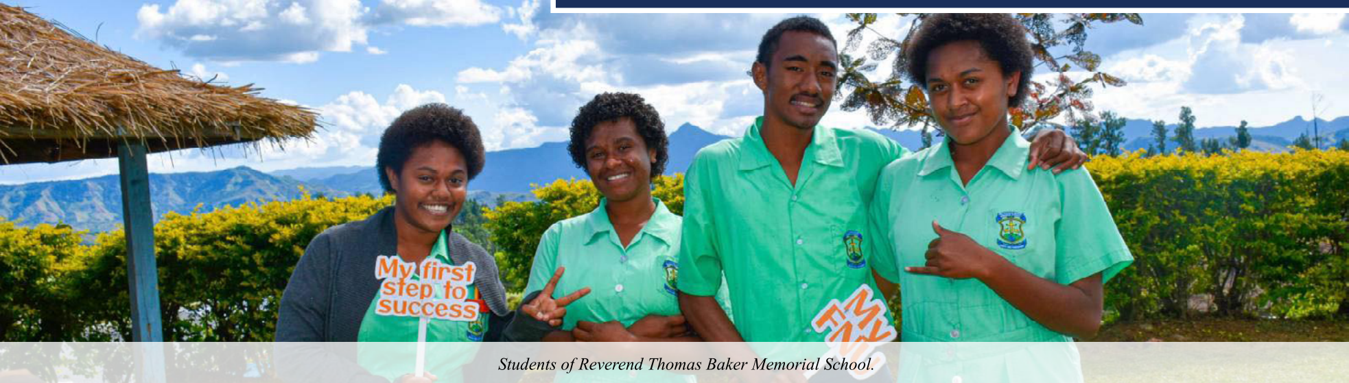
Students of Reverend Thomas Baker Memorial School.

The Fiji National University's (FNU) Career Discovery team travelled along the rough terrains of the Nadroga/Navosa highlands to reach the remote school memorialising the late Reverend Thomas Baker.