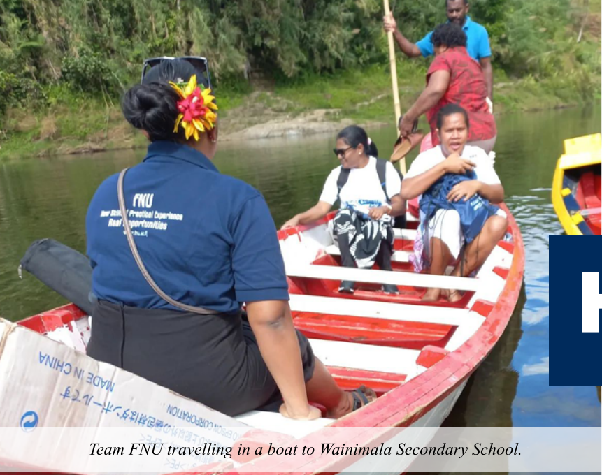
Team FNU travelling in a boat to Wainimala Secondary School.