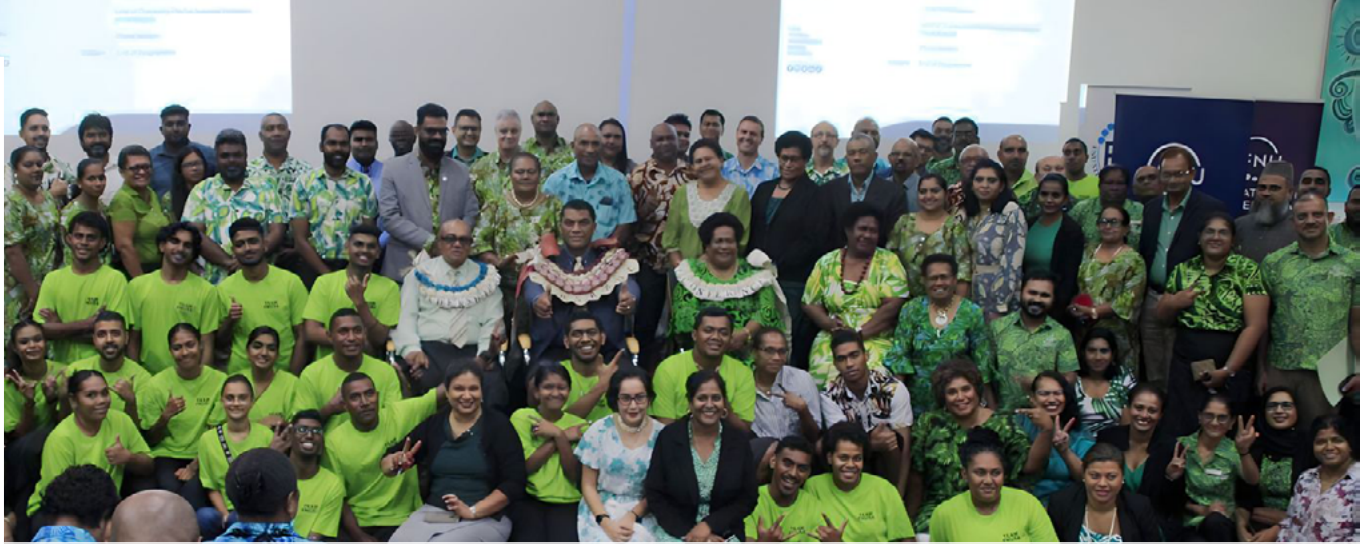
Participants at the Conference with the Chief Guest Minister for Education Honourable Aseri Radrodro.

The Fiji National University Students’ Association (FNUSA) plays a vital role in representing and advocating for students’ interests at the Fiji National University (FNU).