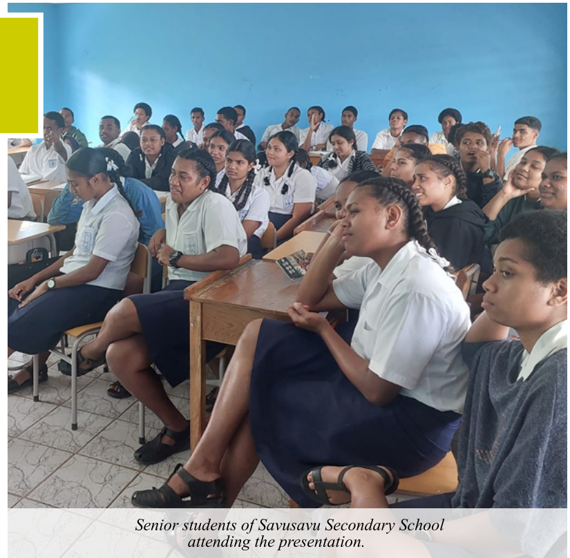
Senior students of Savusavu Secondary School attending the presentation.

"Their newfound awareness will undoubtedly shape their future enrollment decisions, enabling them to embark on a path towards success."