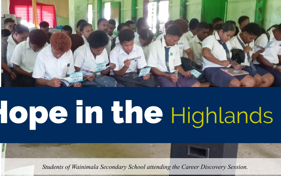
Students of Wainimala Secondary School attending the Career Discovery Session.