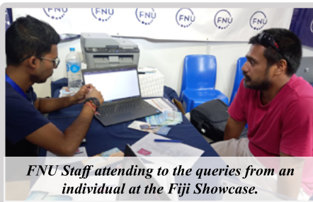
FNU Staff attending to the queries from an individual at the Fiji Showcase.