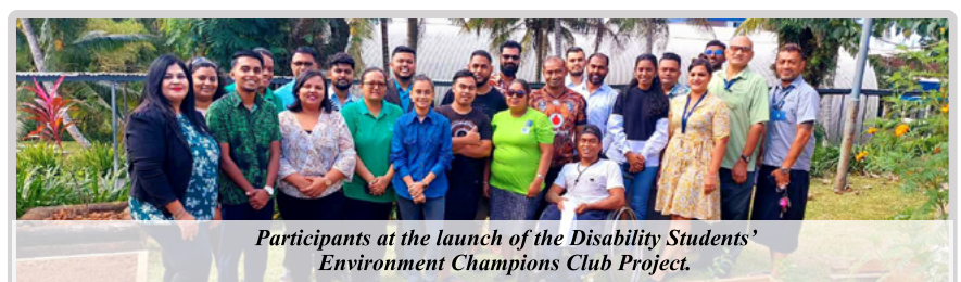
Participants at the launch of the Disability Students' Environment Champions Club Project.