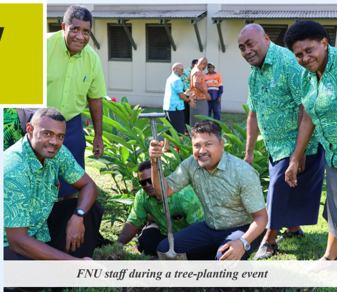
FNU staff during a tree-planting event

"It is important that we are leading the fight in