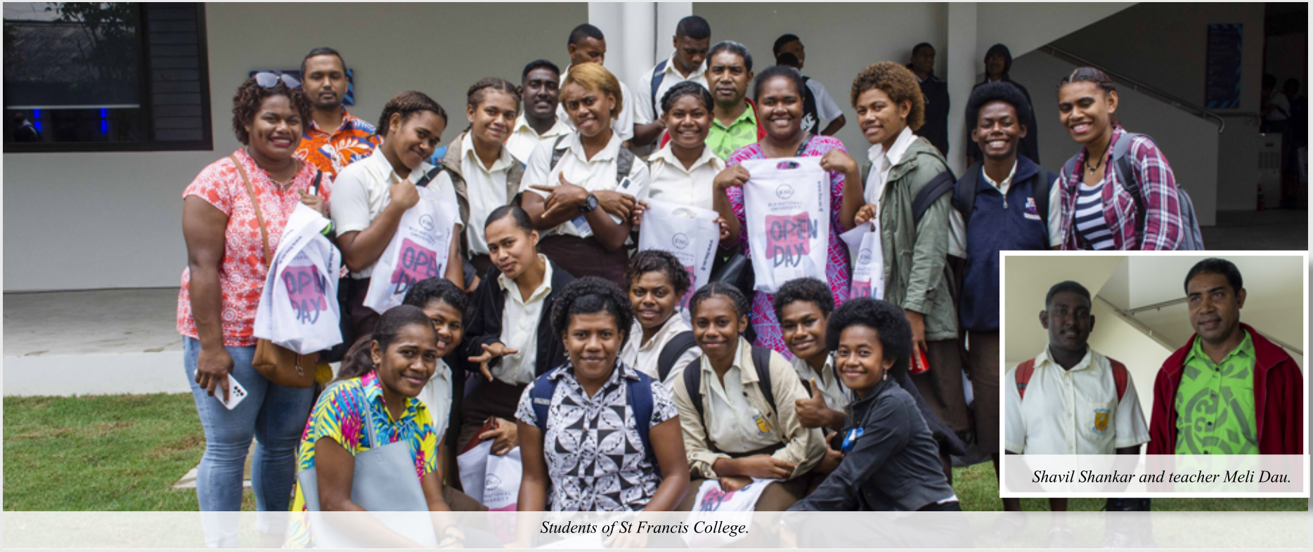
Students of St Francis College.