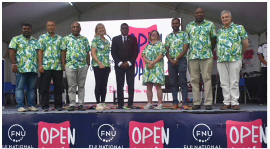
Minister for Agriculture, Waterways and Environment, Honourable Mahendra Reddy with the FNU Senior Leadership Team.

“We want the intellectuals to help us with policy change and refinement.”