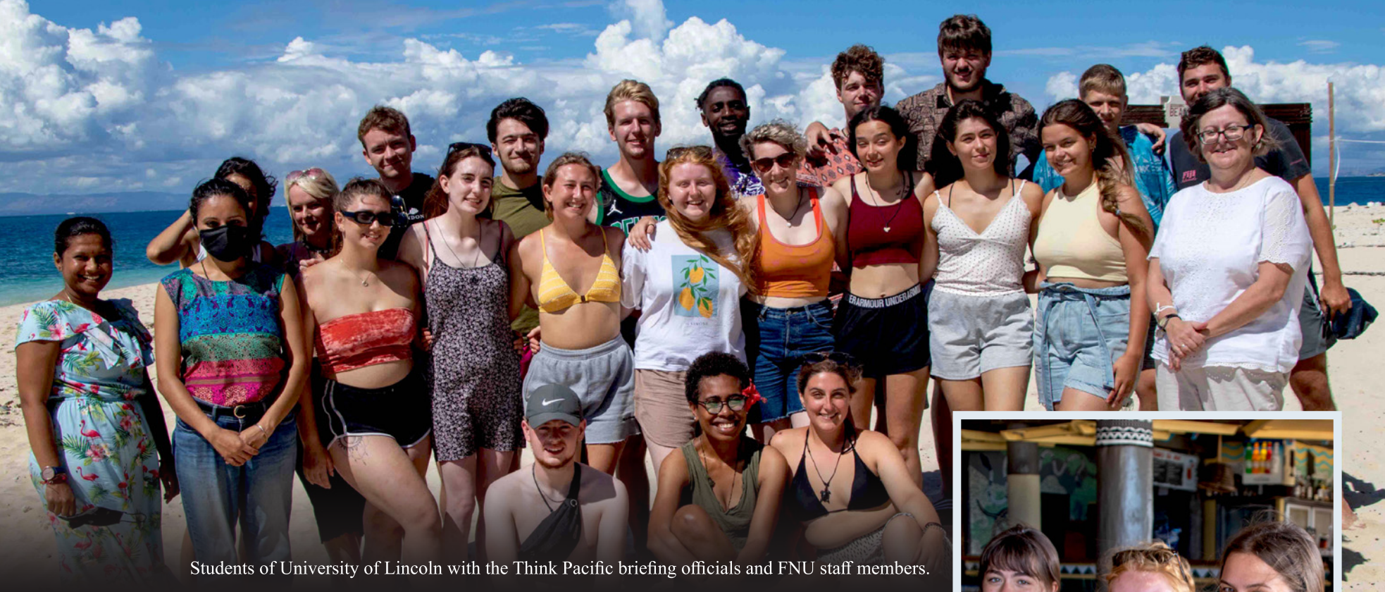
Students of University of Lincoln with the Think Pacific briefing officials and FNU staff members.