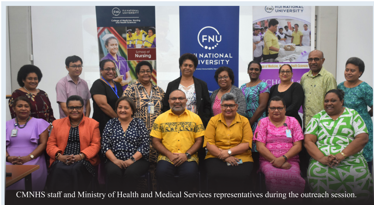
CMNHS staff and Ministry of Health and Medical Services representatives during the outreach session.

C ollaborating closely with industry partners and stakeholders allows universities to formulate and offer relevant programmes, skills and qualifications and ensures that students are competent and workforce-ready upon graduation.