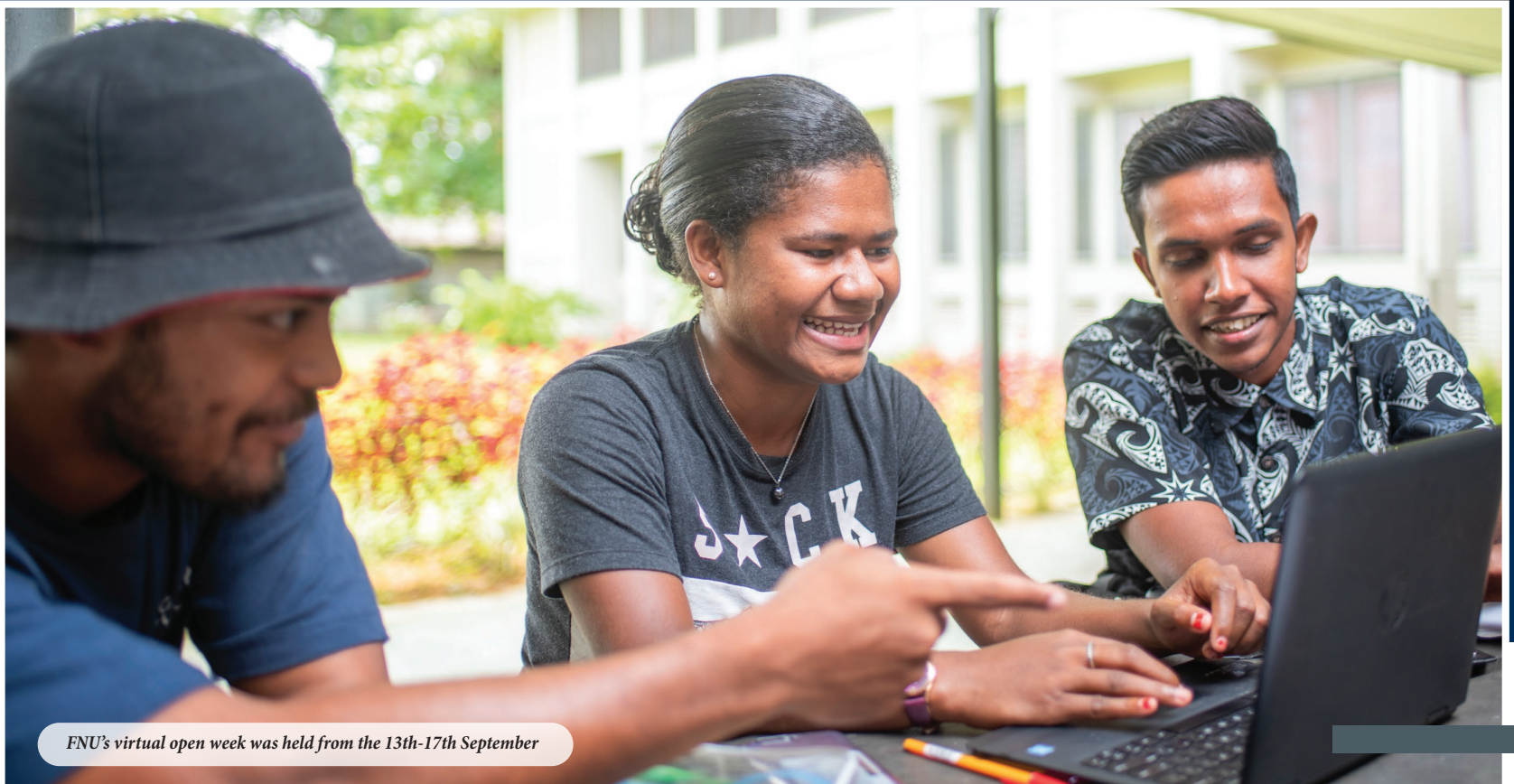
FNU's virtual open week was held from the 13th-17th September

The Fiji National University's (FNU) 2021 Virtual Open Week (VOW) had an impressive turnout of local and regional prospective students, parents, guardians and teachers participating in the live interactive sessions that were held on multiple online platforms including Facebook, Zoom and YouTube.