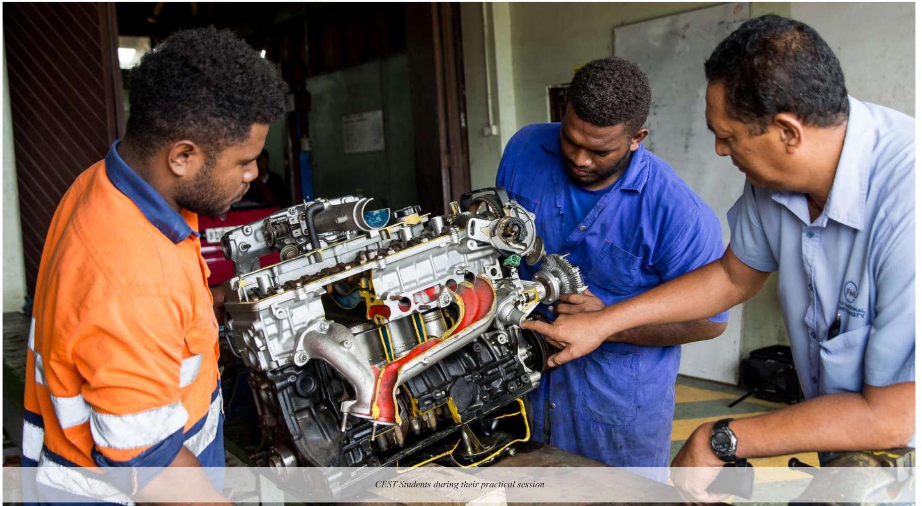
CEST Students during their practical session

As we draw closer to the start of another year, it becomes imperative to get into serious discussions on a prospective study programme that will lead to rewarding careers and given the current world economic situation and the job market due to the COVID-19 global pandemic; it is vital for you to consider your choice of institution and career path carefully.