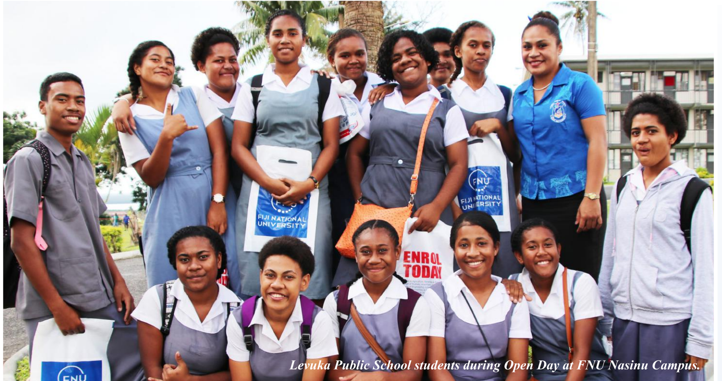
Levuka Public School students during Open Day at FNU Nasinu Campus.

It was an early morning start for eighty-five students from Levuka Public School as they journeyed to the Fiji National University (FNU) Nasinu Campus to be part of the Open Day.