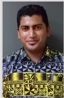
By: Rohit Prasad

Who has not admired those perfect hotel bed-making or miss hotel bed setups for comfort? If you have a room of your own, a slight perfection will do with a sporting bed that looks straight out of a professional decorator's dream. Made neatly enough to win everyone's heart, topped with perfectly positioned shams and throw pillows, and finished with a contrasting throw blanket folded just so at the foot of the bed- these beds look too good to mess up when it's time to sleep.